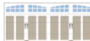
15', 15'6", 16', 18' wide

To visualize on your home, go to www.clopaydoor.com/DIS/garage-door-imagination-system.aspx